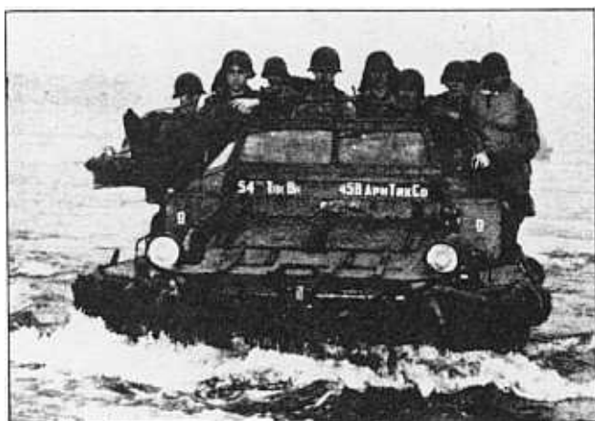
AphTrk COMING ASHORE