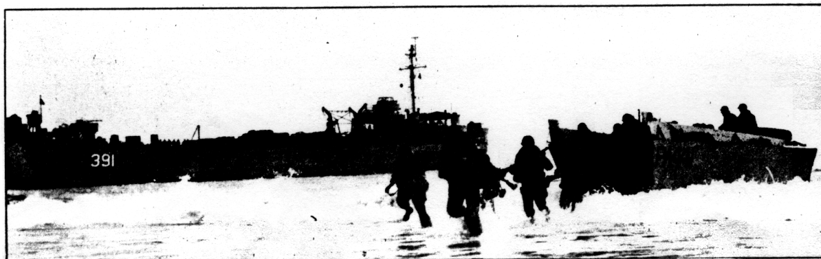
"HITTING THE BEACH" UNDER NORMAL CONDITIONS