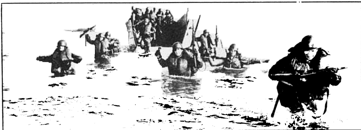
.....BUT SOMETIMES "G-I JOE" HAS TO GET OUT INTO DEEP WATER